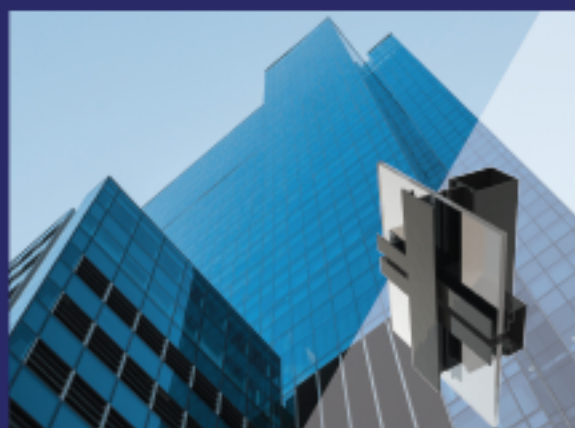
Commercial (Curtain Wall & Sun Shading)