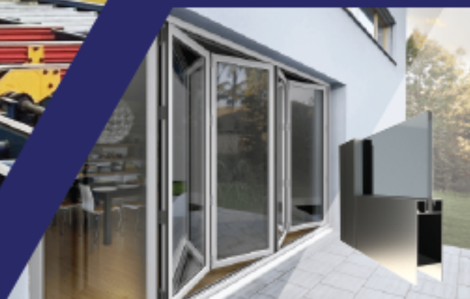
Residential (Door, Window, Ceiling & Partition)

Our products include profiles for use in Residential & Commercial buildings. We also produce profiles for various industries