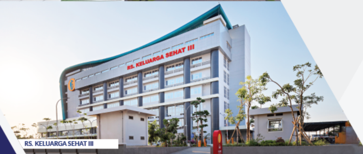
RS. KELUARGA SEHAT III