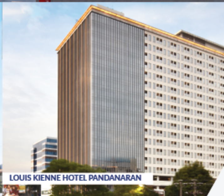
LOUIS KIENNE HOTEL PANDANARAN