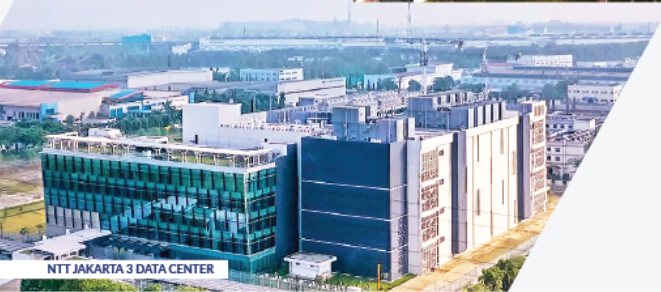
NTT JAKARTA 3 DATA CENTER