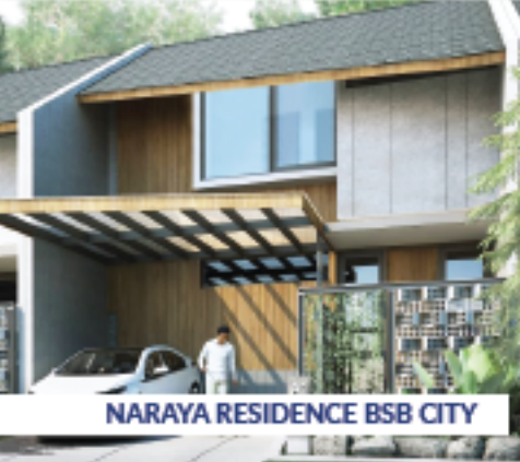
NARAYA RESIDENCE BSB CITY