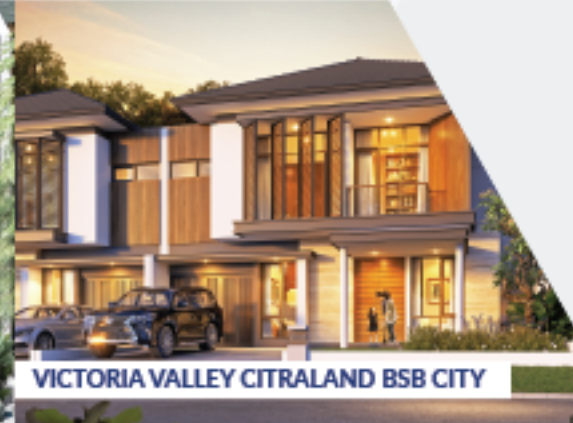
VICTORIA VALLEY CITRALAND BSB CITY