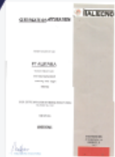
Certified Anodizing by ITALTECNO