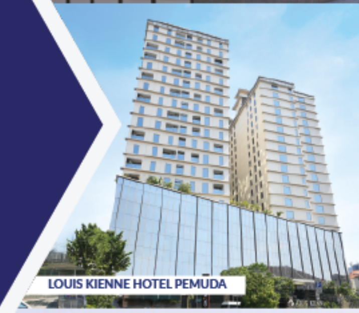
LOUIS KIENNE HOTEL PEMUDA