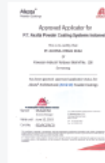
Certificate Powder Coat Application AAMA 2604